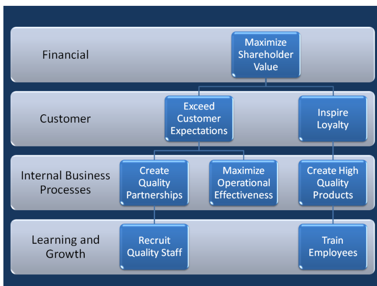
Figure 7.1: A generic strategy map by Mrgrs123

card is a concise but quantified representation of the strategy, the balanced scorecard is used to discover and improve the activities that are crucial for the strategy.